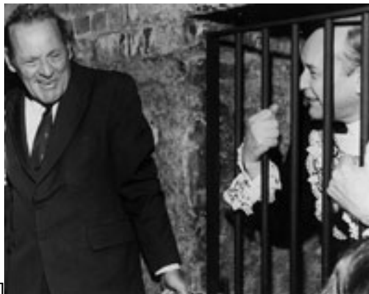
[24]The Lord Mayor

let us lock him in our dungeon and his ransom helped pay for the Pirate Castle