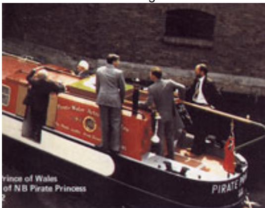
[25]As Charles will be our king one day, they didn't let us ransom him,

let us lock him in our dungeon and his ransom helped pay for the Pirate Castle